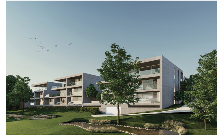
— LOCALISATION DE L'APPARTEMENT